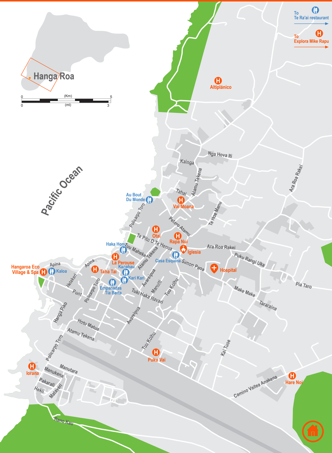
Map detail city of Hanga Roa in Easter Island

In the Island please call: Operator ADSMundo in Rapa Nui (56-9) 9154 7508