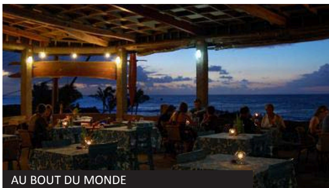
AU BOUT DU MONDE

Location Calle Policarpo Toro S/N, Easter Island, Chile Type of food French, Seafood, European, Polynesian Capacity 80 people Days and Hours Wednesday to Monday (Tuesday closed) from 12:30 a.m. to 3:00 p.m. and from 18:30 to 22:30