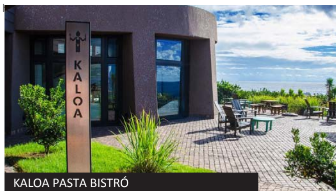
KALOA PASTA BISTRÓ

Location Atamu Tekena, Easter Island, Chile Type of food Fast food, Chilean, South American Capacity - Days and Hours -