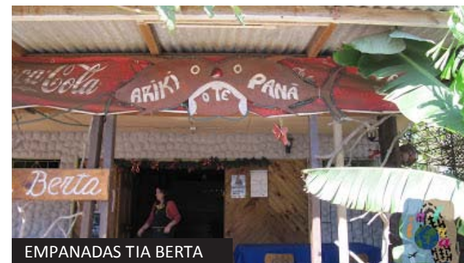
EMPANADAS TIA BERTA

Location Av Policarpo Toro, Easter Island, Chile Type of food Seafood, Polynesia, Chilean, South American Capacity - Days and Hours Tuesday to Sunday from 11:30 a.m. to 11:00 p.m.